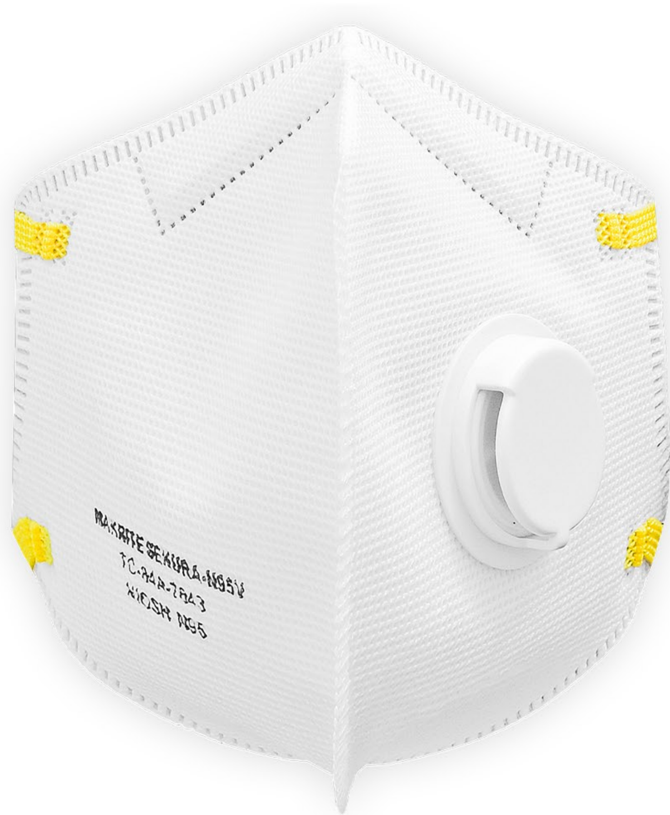
SEKURA N95V M409383321

626 Cochrans Mill Road, Pittsburgh, PA 15236-0070, Phone: 412-386-4000