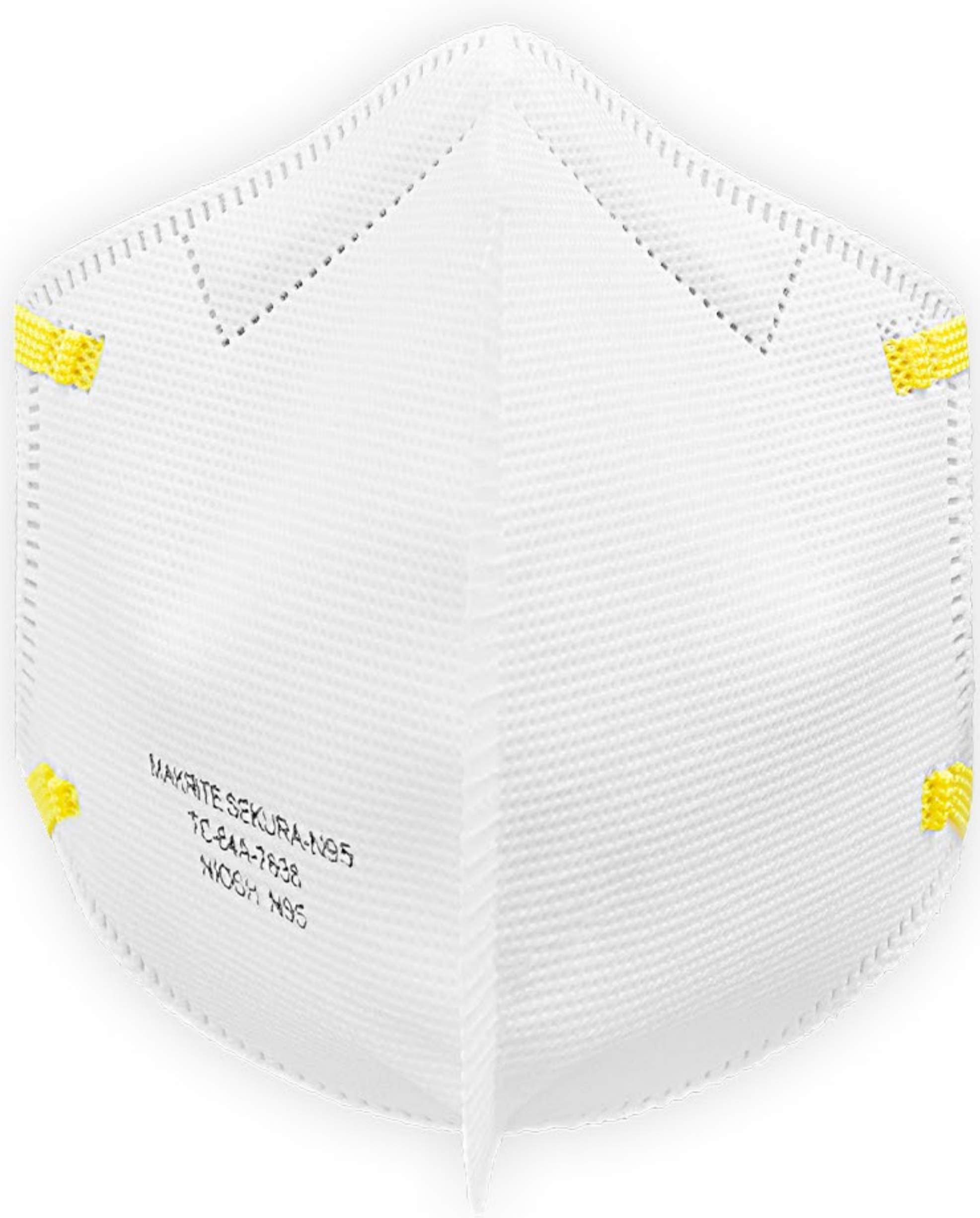
SEKURA N95 M409383320