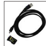
IR connectivity kit