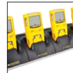
Five unit cradle charger

For a complete list of accessories, please contact BW Technologies by Honeywell.