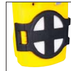
Auxillary filter kit