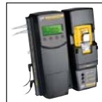
MicroDock II compatible