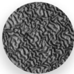
Black Crinkled Latex Palm Coated

Applications: Building / Construction / Carpentry. Forestry / Public Gardens / Nurseries. Waste Collection. Transport Industry. Scaffolding applications.