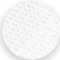
15 Gauge White Polyester Liners