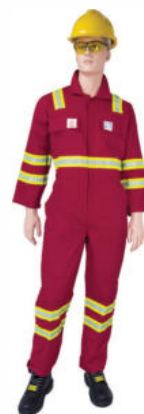
SAFEGUARD – Red E3100512