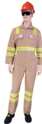
SAFEGUARD – Khaki E3100505