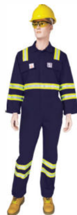
SAFEGUARD – Navy Blue E3100504