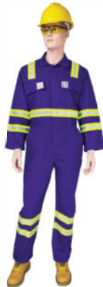
SAFEGUARD – Royal Blue E3100521