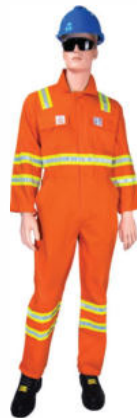
SAFEGUARD – Orange E3100506