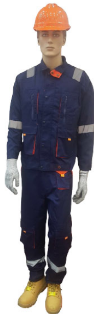
EUROPEAN - Navy/Orange E1060642