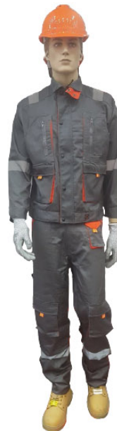
EUROPEAN - Grey/Orange E1060625