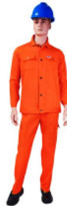
CHIEF - Orange A1050606