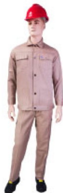
CHIEF - Khaki A1050605