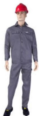
CHIEF - Grey A1050607