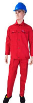
CHIEF - Red A1050612