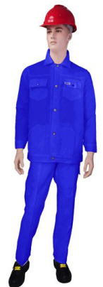
CHIEF - Royal Blue A1050621