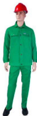
CHIEF - Green A1050610