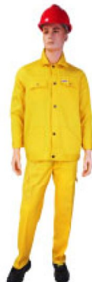
CHIEF - Yellow A1050609