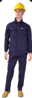
CHIEF - Navy Blue A1050604