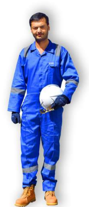
CHIEF Tapes - Patrol Blue A50505030