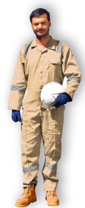
CHIEF Tapes - Khaki A50505050