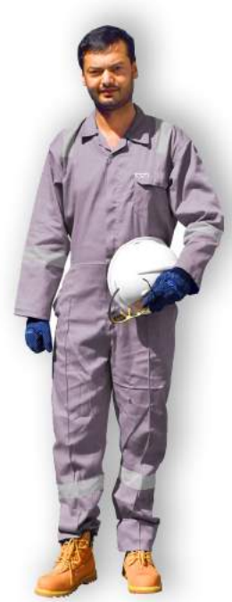
CHIEF Tapes - Grey A50505040