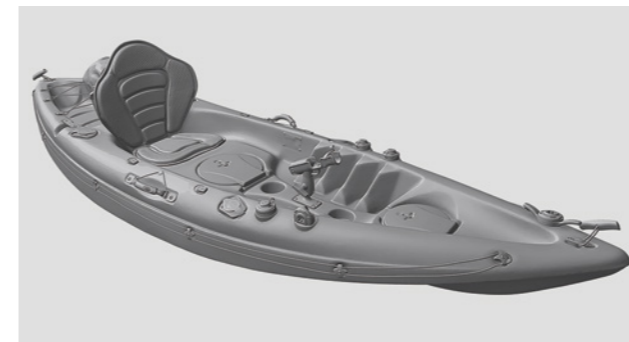
| Turbines, ship propellers, small boats