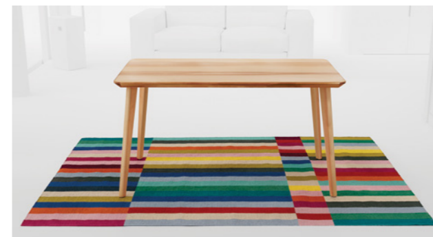
| Furniture and room interiors