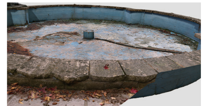
| Crime scenes