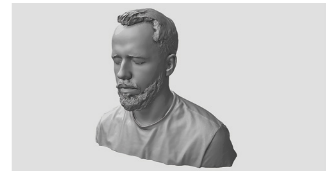
| Statues, and the human body