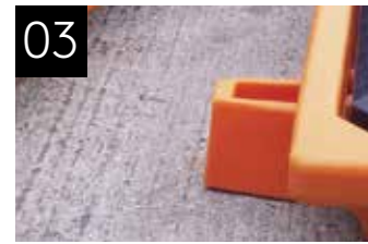
03 Special link blocks Enable easy connection linking one unit to another, creating into a workflow.