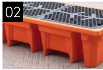
02 Profiled Bottom* Allows for easy transportation by a forklift truck.