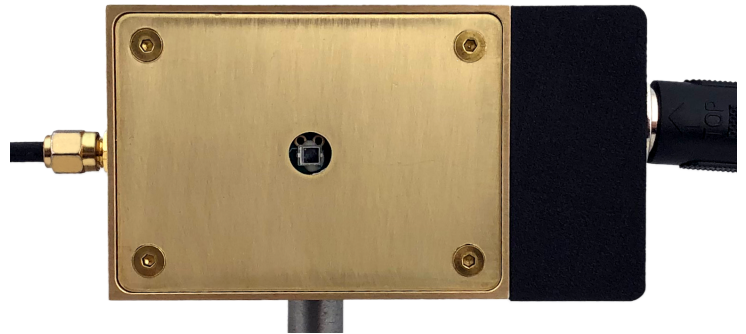
Figure 1: The QL01 family delivers shot-noise limited performance from 7 nA to 1 uA photocurrent.

Competing products may reach this level near DC, but none beyond 10 kHz, a full factor of 100 slower than the QL01. Why should you care about speed? First of all, with 100 times the bandwidth and the same noise level, you get 100 times more data. More subtly, you can do your measurement further from DC, where many sources of noise and interference are much less troublesome. The cost of a photoreceiver is generally a small part of the total system cost, so why not choose the best?