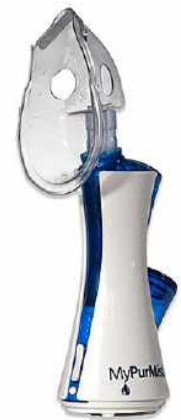
Handheld Steam Inhalers