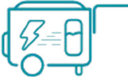
501 to 1,000 kW