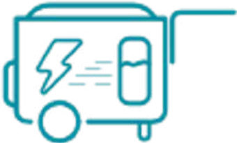
Over 1,000 kW