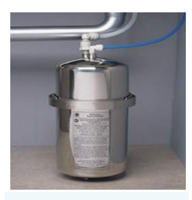
Under the Sink (UTS)

Counter top systems can either be placed on the kitchen counter or can be wall mounted (typically in Asia).