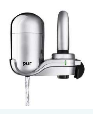
Faucet mount (FM)

UTS systems are usually placed under the kitchen sink and do not clutter the kitchen counter.