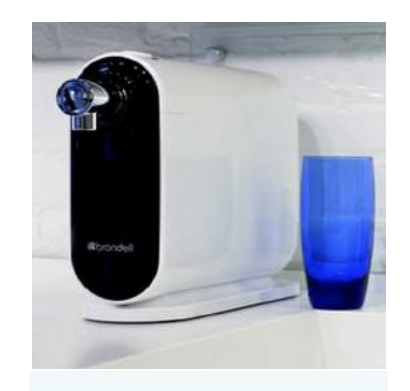
Counter Top (CT)

Point-of-entry or whole house systems treat all the water entering the home.