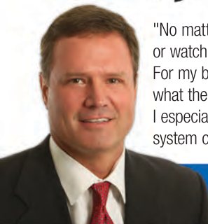
Bill Self, Head Men's Basketball Coach University of Kansas Jayhawks

"No matter where I find myself coaching, playing or watching basketball, I expect quality equipment. For my backyard court, I chose Bison so no matter what the level of play, I know the game is authentic. I especially value the fact that every Bison residential system comes standard with free pole safety padding."