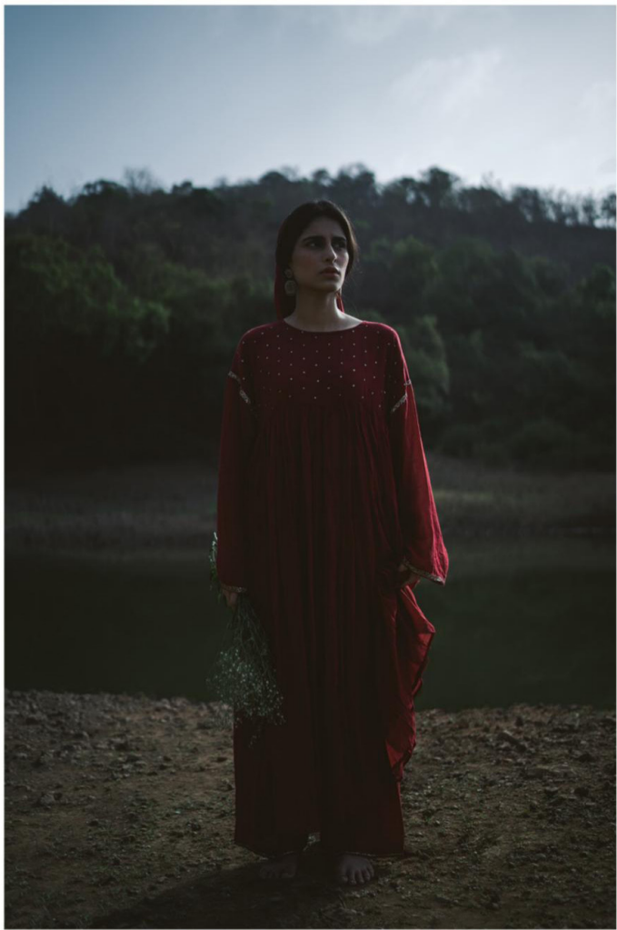
Safun Gathered Kurta Set