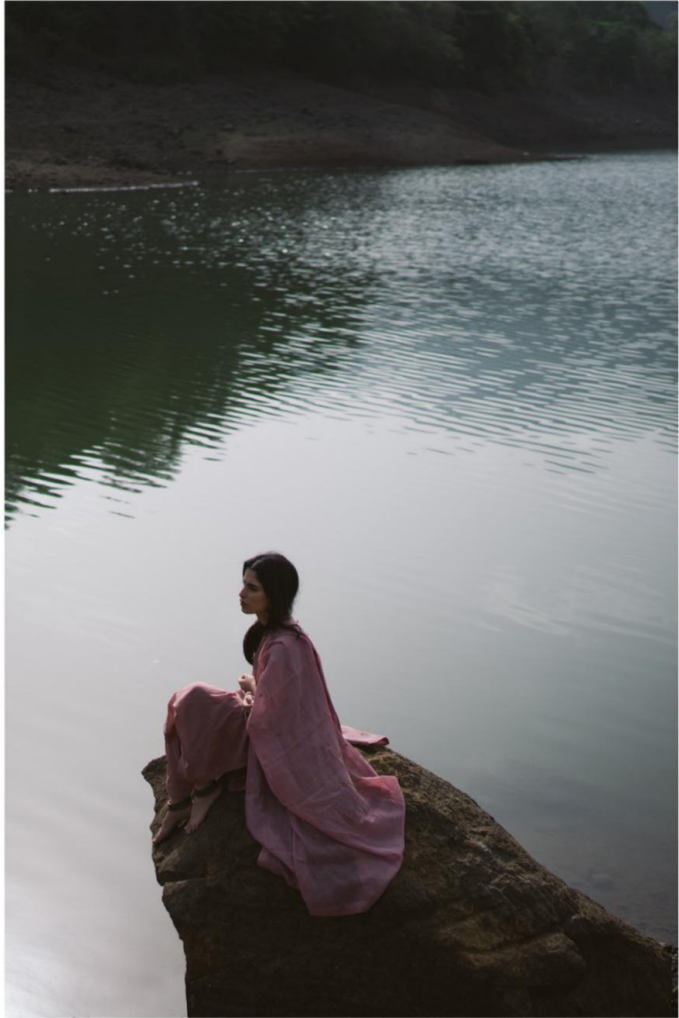
Jarooni Salwar-Kurta with Hadeeqah Dupatta