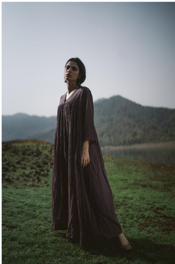
Reyah Gathered Kurta Set