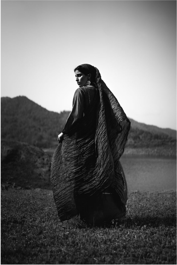
Sabina Bel Kurta Set with Crinkled Dupatta