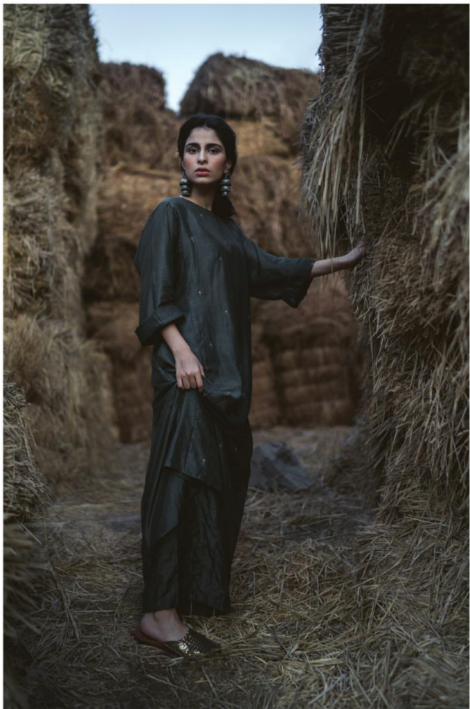
Hadeeqah Chaakbagla Kurta Set