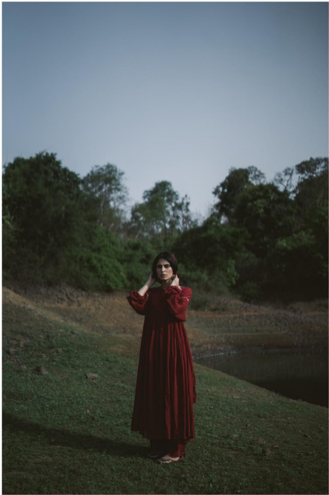
Safun Gathered Kurta Set