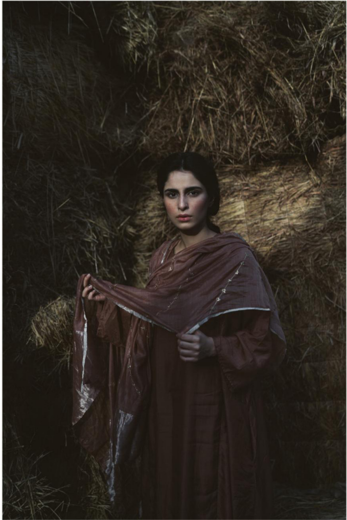
Side Chokhan Chaakbagla Set with Sitrara Bel Dupatta