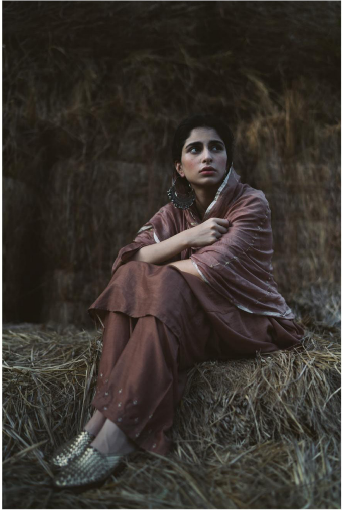
Side Chokhan Chaakbagla Set with Sitrara Bel Dupatta