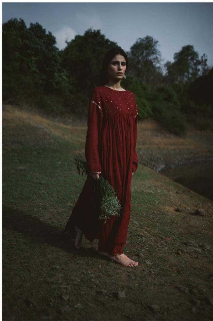
Safun Gathered Kurta Set