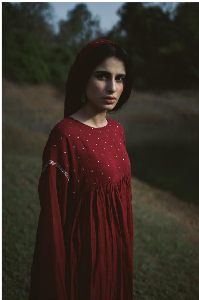
Safun Gathered Kurta Set