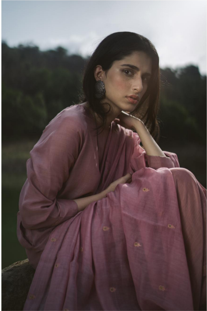
Jarooni Salwar-Kurta with Hadeeqah Dupatta