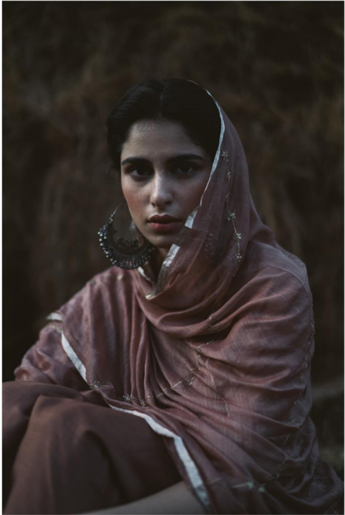
Side Chokhan Chaakbagla Set with Sitrara Bel Dupatta