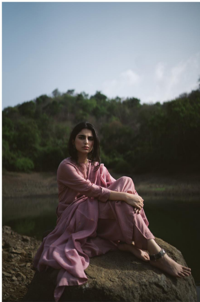
Jarooni Salwar-Kurta with Hadeeqah Dupatta