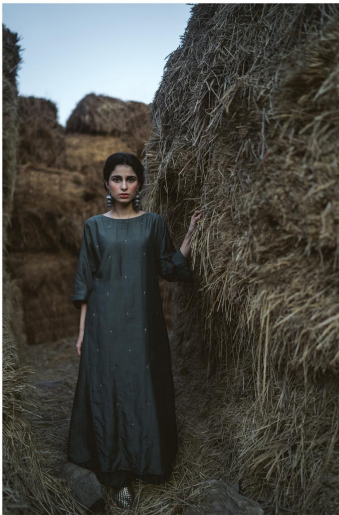
Hadeeqah Chaakbagla Kurta Set