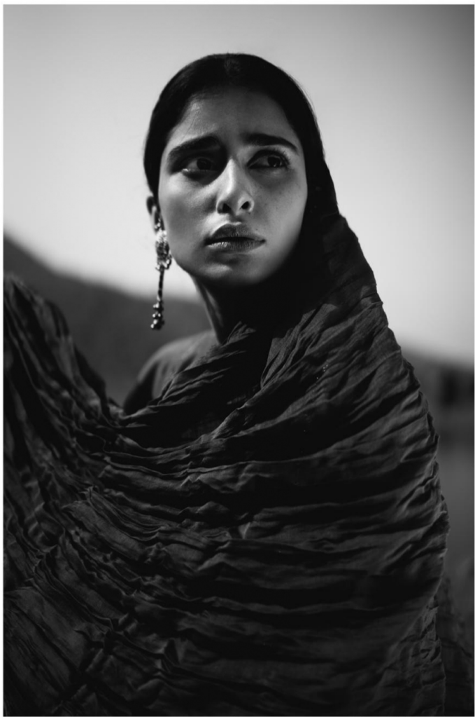
Sabina Bel Kurta Set with Crinkled Dupatta