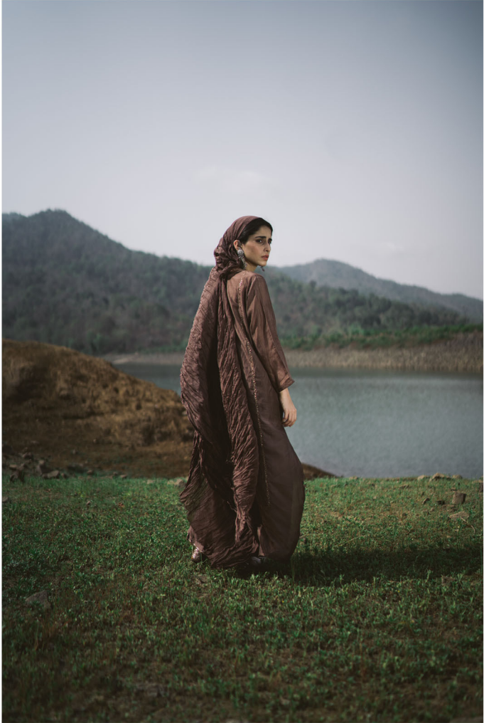
Sabina Bel Kurta Set with Crinkled Dupatta