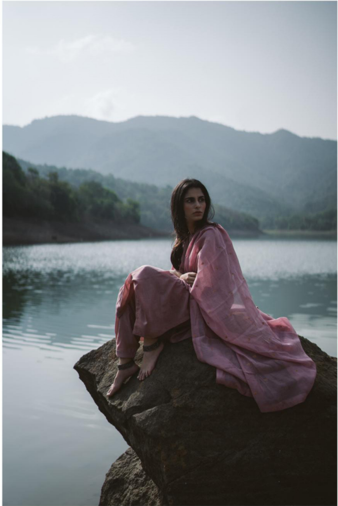
Jarooni Salwar-Kurta with Hadeeqah Dupatta