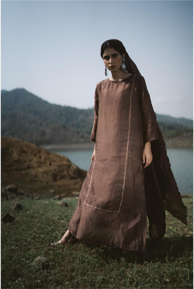
Sabina Bel Kurta Set with Crinkled Dupatta