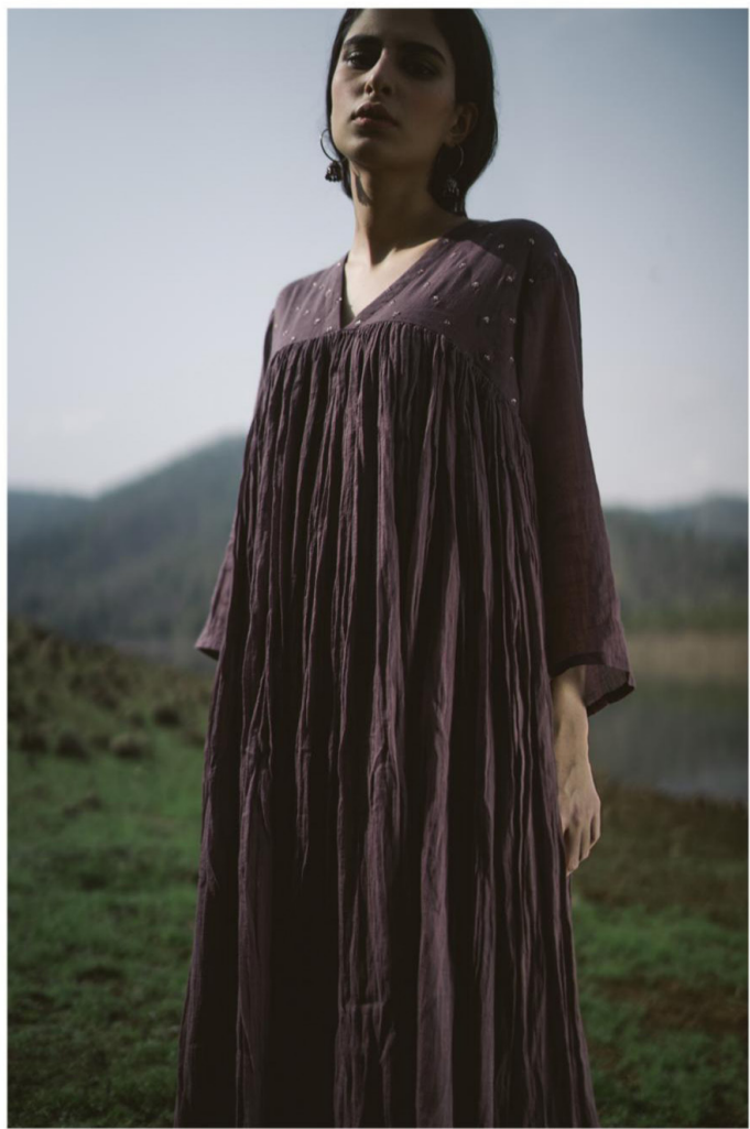
Reyah Gathered Kurta Set