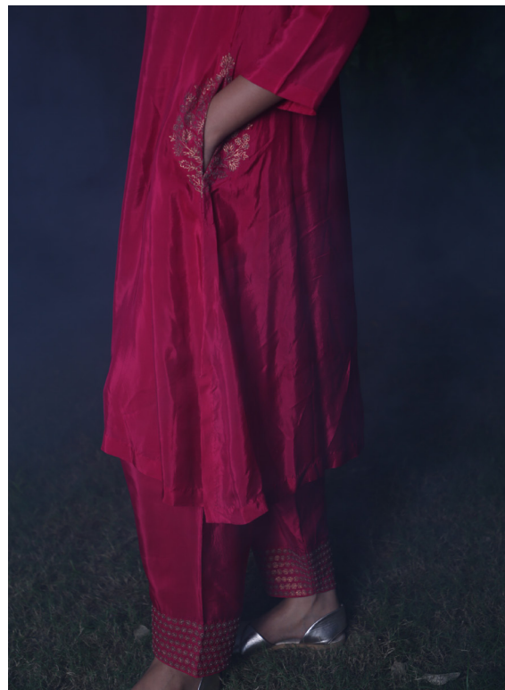
POCKET STYLE KURTA & LAHORI