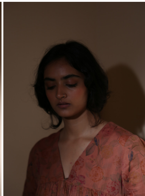
BURNT ORANGE BAGH K-1 KURTA SET