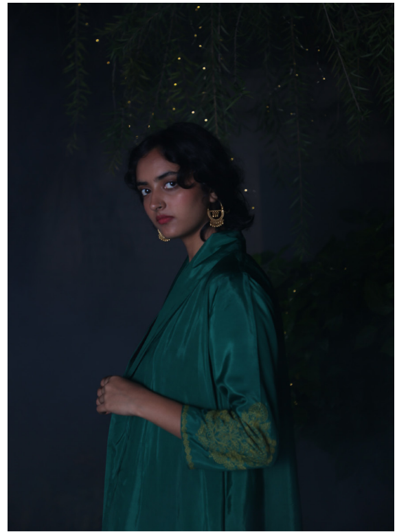
EMERALD SILK LONG JACKET