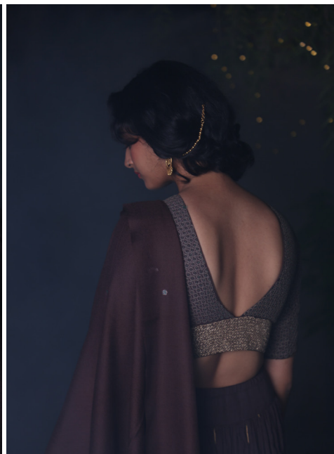
KALI LEHENGA , HAFIZA BLOUSE & BUTA SHAWL