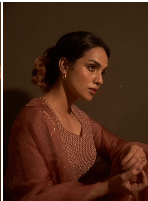
CHAUKOR ANARKALI & ORGANZA DUPATTA