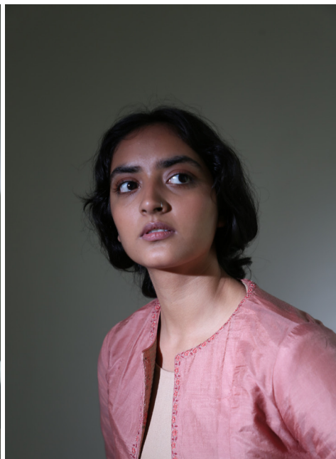
BLUSH GRID REVERSIBLE JACKET