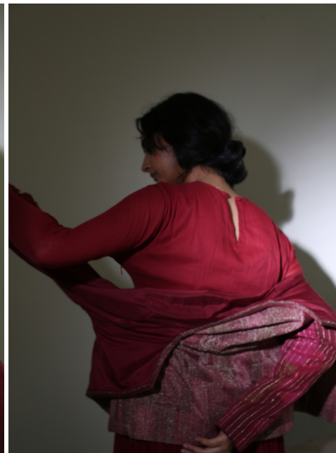
DEEP MAROON REVERSIBLE JACKET