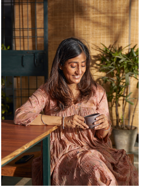
BAGH K-1 KURTA SET