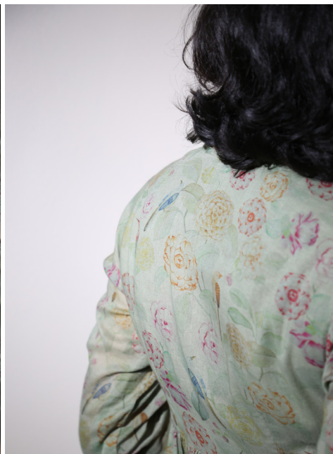
MINT ANGRAKHA KURTA