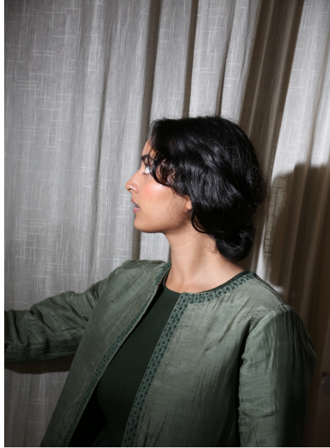
MINT KANTHA STITCH REVERSIBLE JACKET