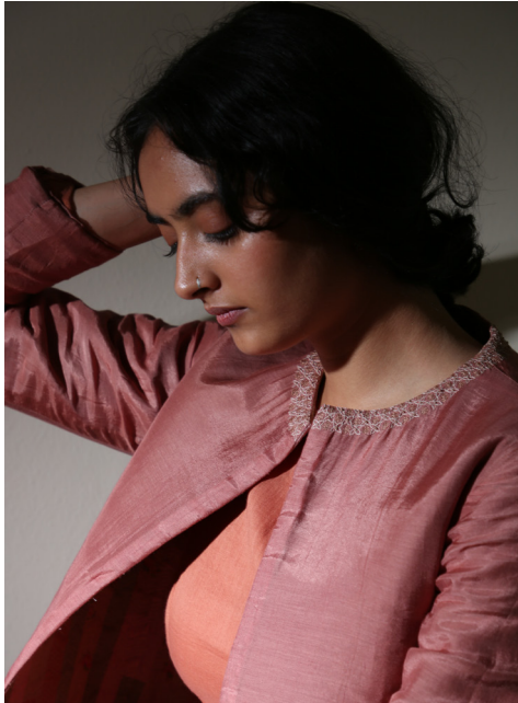
FLORAL BLUSH CHEVRON REVERSIBLE JACKET