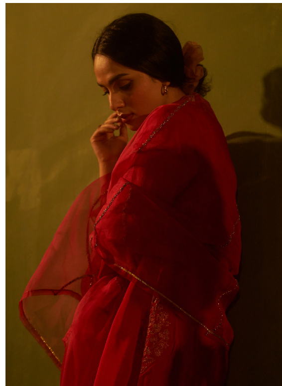
POCKET STYLE KURTA & LAHORI