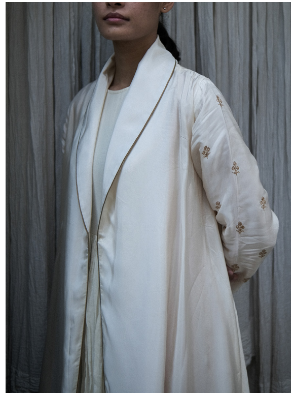
IVORY LONG SILK JACKET