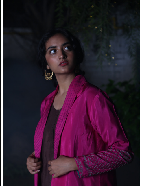
RANI REVERSIBLE SILK JACKET