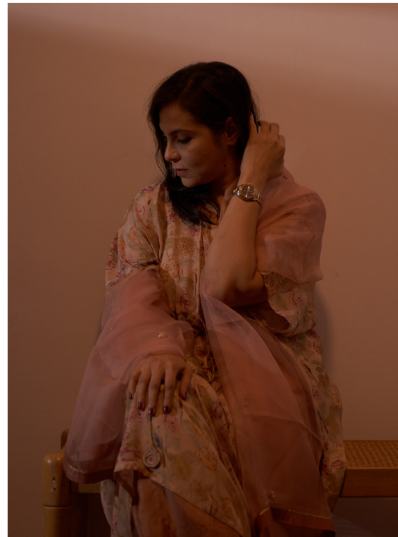
PRINTED KAFTAN KURTA & BUTI ORGANZA DUPATTA