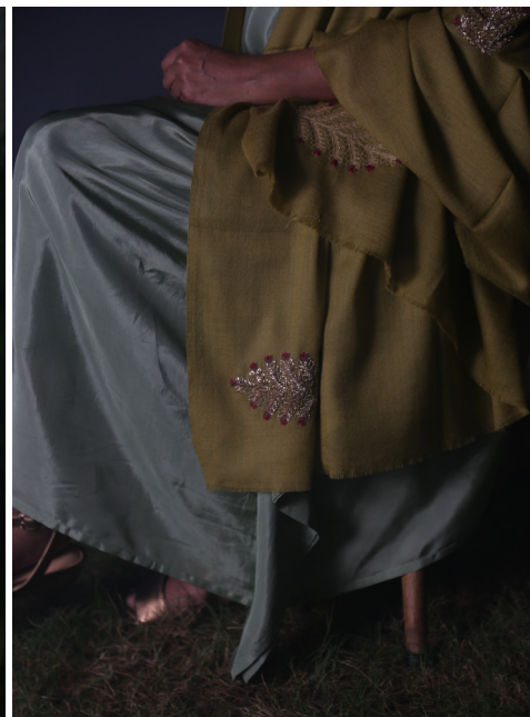
KAFTRAN PAIRED WITH PASHMINA EMBROIDERED SHWAL