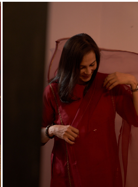
ALBELA KURTA SET & ORGANZA BUTI DUPATTA