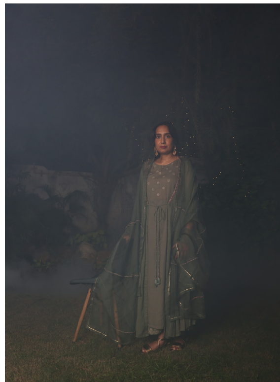
MUL MUL KURTA & ORGANZA BEL DUPATTA