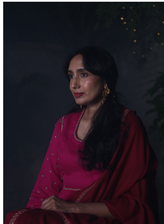
RANI MUL KURTA & BEL SHAWL