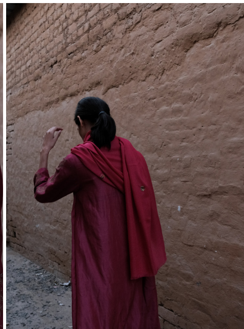
ANGRAKHA KURTA WITH CHAND SHAWL