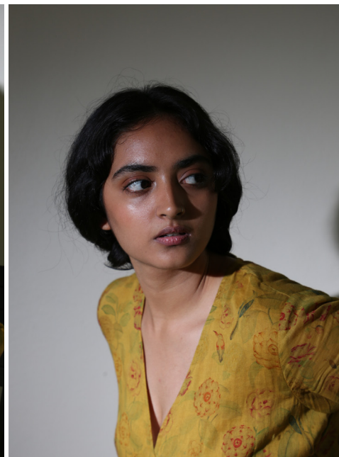
MUSTARD ANGRAKHA KURTA