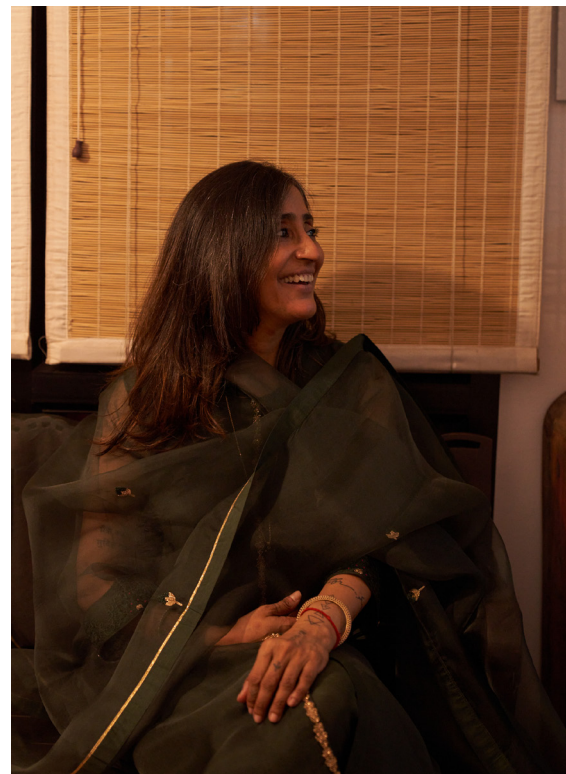
ILLA KURTA SET WITH DUPATTA