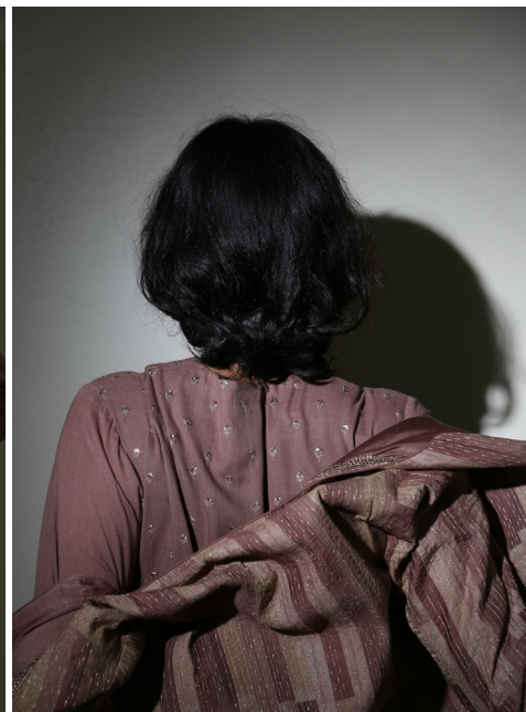
CHOCO BROWN PATCHED REVERSIBLE JACKET