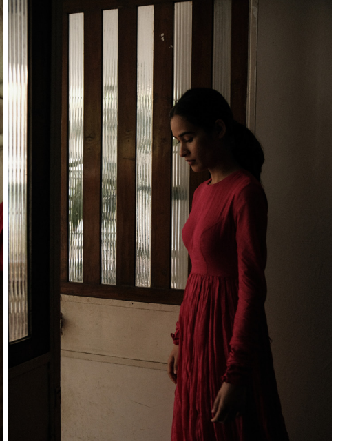
RED HUMZA ANARKALI