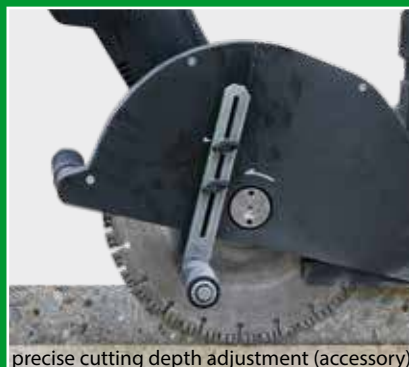
precise cutting depth adjustment (accessory)