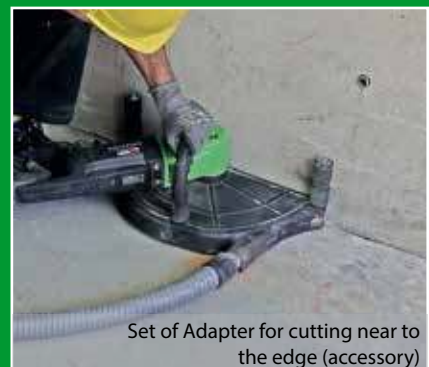
Set of Adapter for cutting near to the edge (accessory)