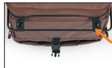
Down safety buckle