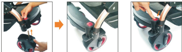
Assemble the front wheel

Pull the front part of the frame up and insert the metal bar into the front wheel.