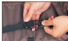
Mid safety buckle