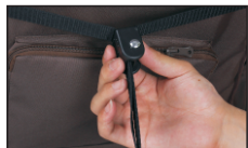
Upper safety buckle

The shifting of the seat and sleeping basket status is accomplished by four safety clasps at the bottom, transforming the bottom four safety clasps into seat mode. Release the bottom safety buckle to sleep mode