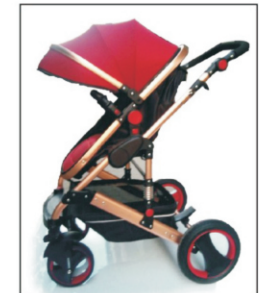
Seat forward sitting