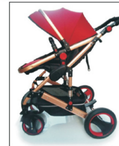
Seat forward reclining