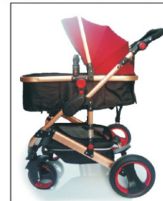
Seat forward lying

The seat/sleeping basket can be adjusted in 6 different positions by pressing the two round buttons on both sides of the basket.