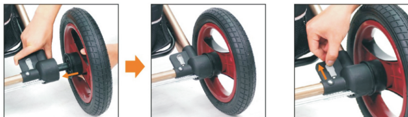
Assemble the rear wheel

Pull up the back part of the frame and insert the metal bar