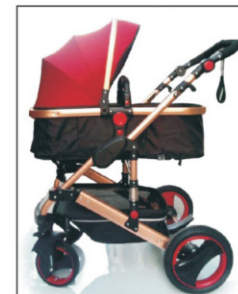
Seat backward lying