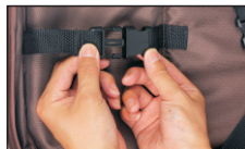
Lower safety buckle