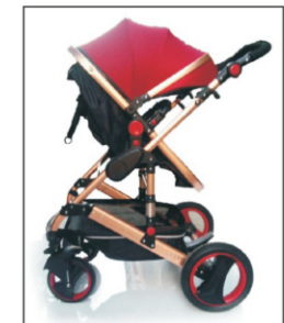
Seat backward sitting