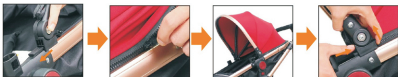
Insert the canopy

Insert the clamp on both sides of the canopy into the slot of the seat/sleeping basket. Then pull up the zipper.