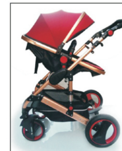
Seat backward recling