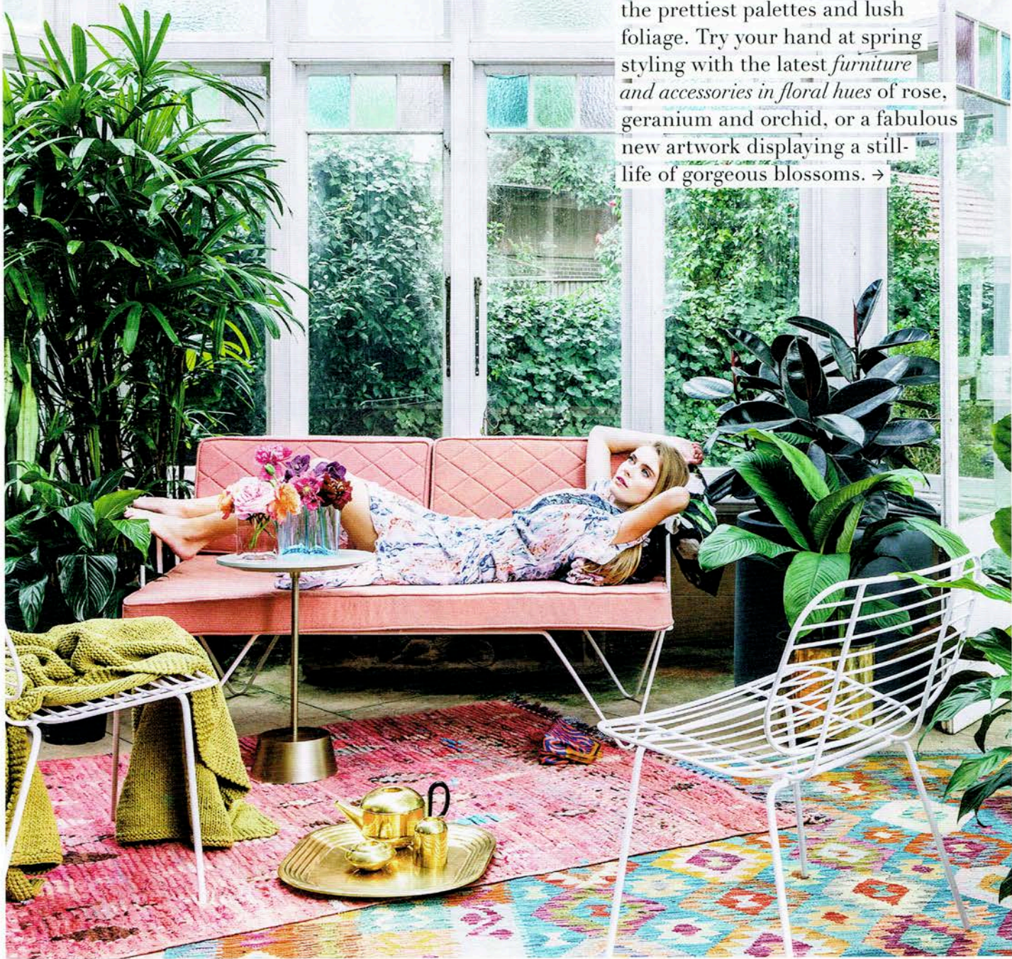
SITTING PRETTY Racquet easy chairs in White, $499 each, and Loop 2-seat sofa in Coral Pink, $1755, Space To Create. Maisie side table , $279, West Elm ON EASY CHAIR Knit One blanket in Army, $119.95, Mark Tuckey X Cotton On. ON SIDE TABLE Ruutu vase Salmon Pink (11.5 x 14cm), $249, and Alvar Aalto Collection vase in Light Blue (16cm), $249, Iittala. ON SOFA Dogwood velvet European pillowcase in Black, $100, Bonnie And Neil. ON FLOOR Tom Dixon square tray , $335, teapot , $375, sugar dish and spoon , $155, milk jug , $130, Dedee. Flames clutch , $135, Karen Walker. Strawberry Swing rug , $2000, and Classic kilim rug , $3000, Koskela. JULIA WEARS Mojave dress with sleeve, $749, Ginger & Smart. OPPOSITE The Heartbeat Of Silver Light oil-on-linen artwork by Craig Waddell; similar works available through Edwina Corlette Gallery and Craig Waddell. Check out more of Craig's works on his Instagram @craigwaddellartist

As the days get warmer and spring is on the doorstep , throw open the windows and breathe new life into your home. Bring the outdoors in with beautiful blooms , the prettiest palettes and lush foliage. Try your hand at spring styling with the latest furniture and accessories in floral hues of rose, geranium and orchid, or a fabulous new artwork displaying a still-life of gorgeous blossoms. →