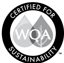
FIGURE 4-2: WQA's Sustainability Mark.

manufacturer according to independent standards developed by a WQA task force of environmental experts, consultants, regulators, manufacturers, industry professionals, and other stakeholders.