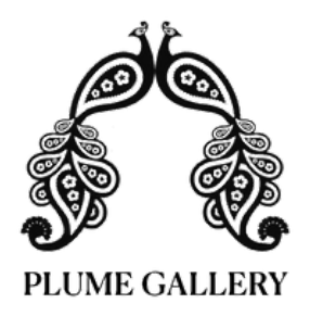
EXHIBIT WITH PLUME