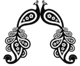
EXHIBIT WITH PLUME