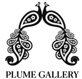
EXHIBIT WITH PLUME