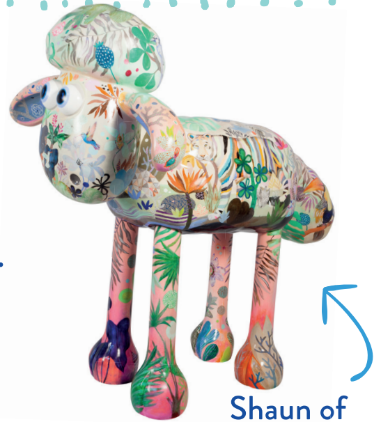
Shaun of the Jungle

Shaun is disguised as a tropical rainforest, inspired by the jungle's exotic flora and fauna. The 13 animals below all live in the rainforest or jungle, can you find them all?