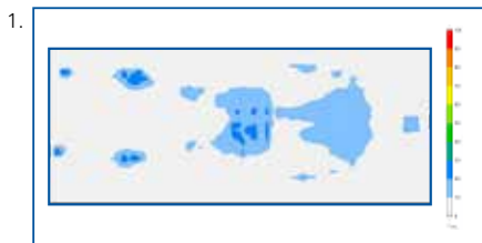
1. Test shows subject in supine position demonstrating contact measurement between key pressure points using Boditrak mapping technology on the SPS1084 support surface. Subject: Male 5'11", 185 lb.