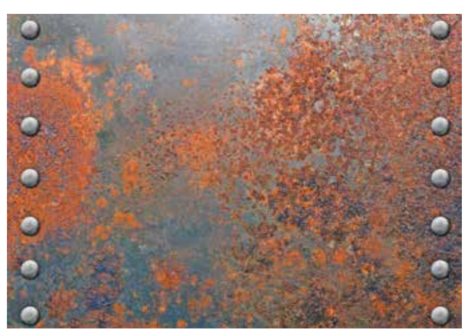
| Rusting is a chemical change.

Color change. Another way to detect a chemical change is by comparing colors. When the leaves turn colors in the fall, a chemical change has occurred. The next experiment will show how color is used in reaction detection.