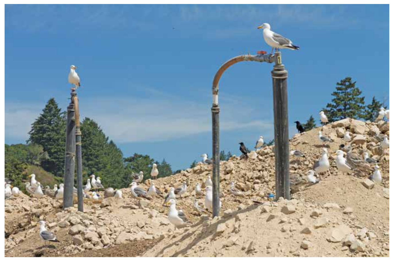
| Methane can also be harvested from landfills.

Our study will investigate this third way to detect chemical reactions.