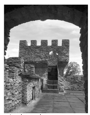
As shown here, a strong castle should at least have a lookout tower to help detect the approach of an enemy.

1. Research the modern city of Santiago de Compostela as a tourist. What would you find there? Find the name of one hotel, a few restaurants, one shopping district, and one tour. Most of this information is easily obtained on the Internet. Create a two-day itinerary for your family. Type it up and file it in your Student Notebook under "Europe: Spain." Discuss with your teacher the obstacles a pilgrim would face when traveling in the Middle Ages!