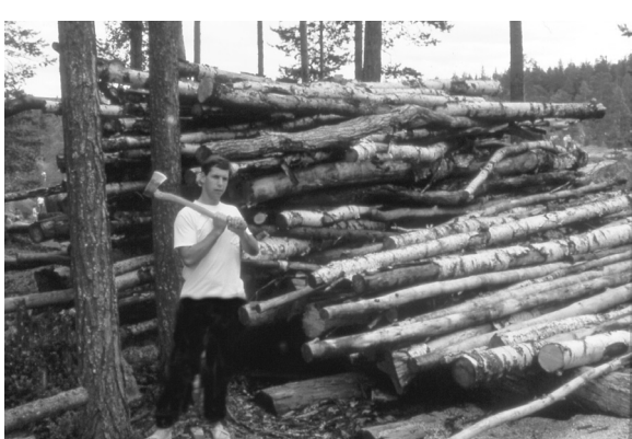
Because tall timber was valuable for building homes and ships, it was important to the Vikings to return to North America where there seemed to be plenty of thick forests.