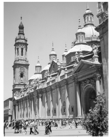
Though no longer under Muslim rule, Saragossa (or Zaragoza) remains a beautiful city in Spain. Pictured is the Basílica del Pilar.

Then in 1089, for a mere fee of 10,000 gold dinars, El Cid switched loyalties again and led 7,000 men in capturing Valencia from Muslim forces! Valencia, a large city on the Mediterranean shore of Spain, was an important port city to Muslims and Christians alike. Total possession of it was critical for either side.