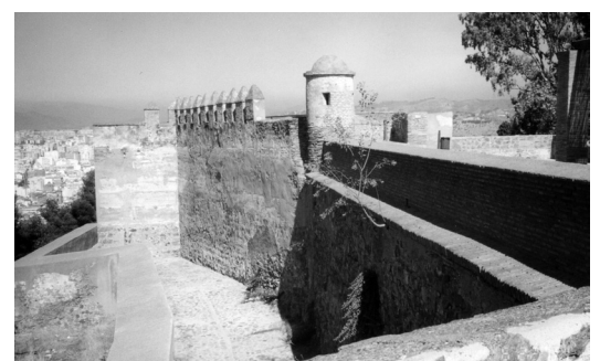
Castillo de Gibralfaro is the name of this castle fort in Malaga, Spain.

This discovery—be it legend or fact—inspired thousands of Christian pilgrims to visit the area. During this era of the Middle Ages, the holy site at Santiago de Compostela was second in popularity only to the city of Jerusalem. All this to say that the number of Christians in Spain grew as a result of the renewed interest in the faith. And with this growth came renewed passion to reclaim all of Spain