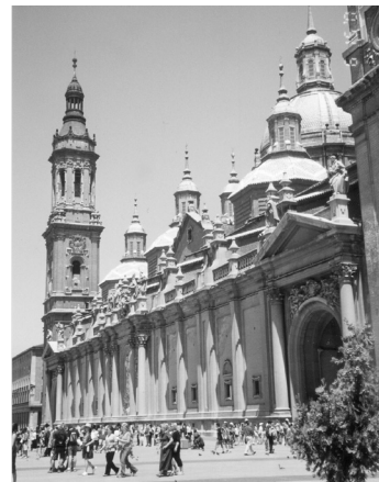
Though no longer under Muslim rule, Saragossa (or Zaragoza) remains a beautiful city in Spain. Pictured is the Basílica del Pilar.

Then in 1089, for a mere fee of 10,000 gold dinars, El Cid switched loyalties again and led 7,000 men in capturing Valencia from Muslim forces! Valencia, a large city on the Mediterranean shore of Spain, was an important port city to Muslims and Christians alike. Total possession of it was critical for either side.