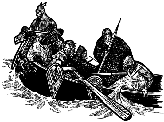
Leif Ericsson and his men reached the coast of Canada, making them the first known white men to explore North America.

Leif Ericsson's next and final stop is the one that is of the most interest. It seems he sailed at least as far as Newfoundland (NOO fun land), Canada , and possibly to the coast of Nova Scotia, Canada . This makes Leif Ericsson the first known white man to visit the mainland continent of North America! Though he didn't stay long, Leif stayed long enough to get credit for it.