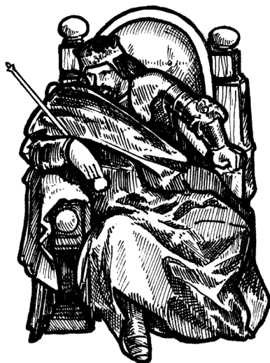
Macbeth, a mere general in the army, declared himself the king of Scotland after killing Duncan I.

There was a problem though. Duncan I had a son—a son who rightfully should have been king had it not been for Macbeth. This son's name was Malcolm III . He wanted revenge for his father's death as well as to be the king of Scotland. So, the plot thickens. In 1054 Malcolm III teamed up with Siward of Northumberland in a fight against Macbeth. This happened at a place called Dunsinane . Technically speaking, Malcolm III and Siward won—but they were unable to remove Macbeth from the throne.