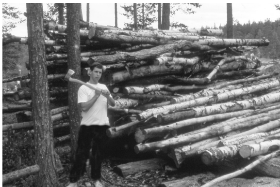
Because tall timber was valuable for building homes and ships, it was important to the Vikings to return to North America where there seemed to be plenty of thick forests.

The Viking settlers fared well for a time in America. With the local natives, they traded things like dairy products and red cloth for furs and wood. They might have stayed much longer, but they began to run into some trouble. Their trouble was that the native people were becoming more and more hostile toward them. The Vikings called these dark, stocky people skraelings . They may have been Inuit or they may have been Native Americans . (Of course, thousands of Native Americans were in North America long before Leif Ericsson.) No one knows for sure who the local people in Vinland were. But whoever they were, they must not have been attractive to the Vikings. The name skraelings , as given by the Vikings, means “ugly people.” With numerous incidences between the Vikings and the skraelings, Thorvald’s settlers felt it best to leave. They only returned on occasion for timber.