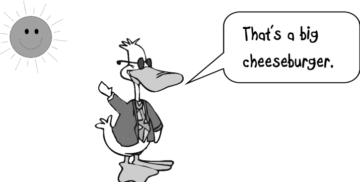
That's nuts! I, your reader, know that's the sun and not a cheeseburger. How in the world can Fred think that this lying Duck is a Fountain of Truth as he calls it?

Fred liked the fact that Duck could only utter logic sentences, but that's not what intrigued Fred. He realized that Duck was a Fountain of Truth.