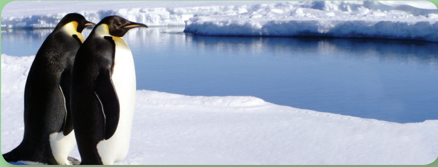
Penguins live near the water in the Antarctic.

The Antarctic is land surrounded by water. The land is a desert. There are no plants. All the animals find their food in the ocean.