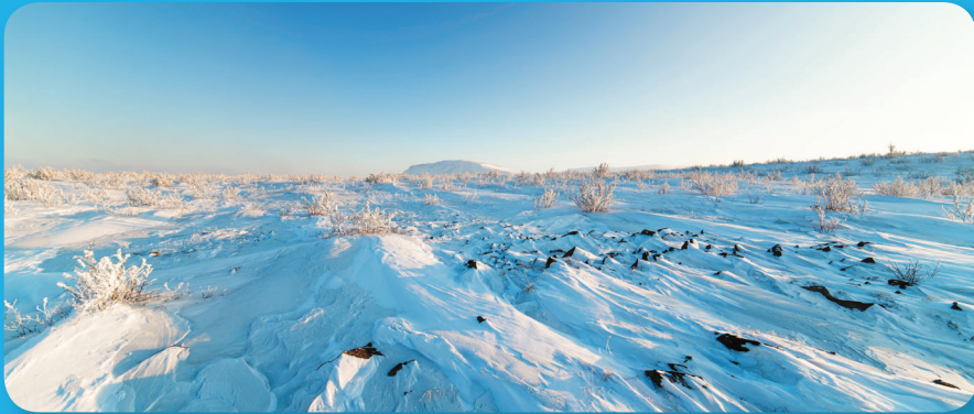
Winter tundra with small plants

The Arctic has cold winters with lots of snow. It can be as cold as -58^{\circ} F. In the winter, snow falls and covers the ground. The Arctic has short, cool summers.