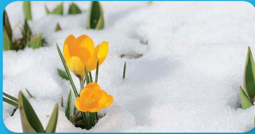
Flowers blooming in snow