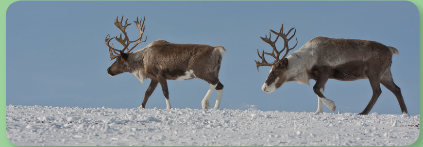
Caribou in the Arctic

The Arctic is water surrounded by land. It snows often in the Arctic. The land in the Arctic is tundra, and plants and land animals live there.