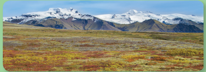
Tundra in the summer in the Arctic

The Arctic is a circular area with water in the middle and land around it. Because it is so cold, the water freezes into ice. The water is called the Arctic Ocean.