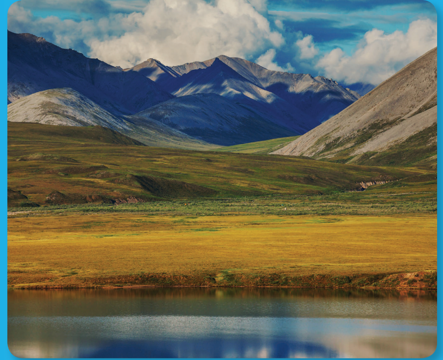
Arctic tundra in summer

Many kinds of animals live in the Arctic. The Arctic Ocean is filled with whales and fish. Many animals, such as polar bears, seals, and walruses, live on land and hunt in the ocean.