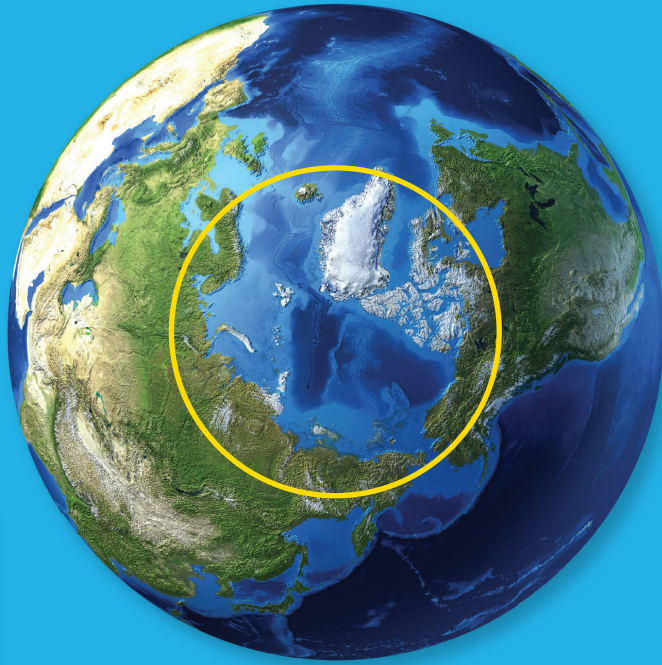
Water surrounded by land

The Arctic is a circular area with water in the middle and land around it. Because it is so cold, the water freezes into ice. The water is called the Arctic Ocean.