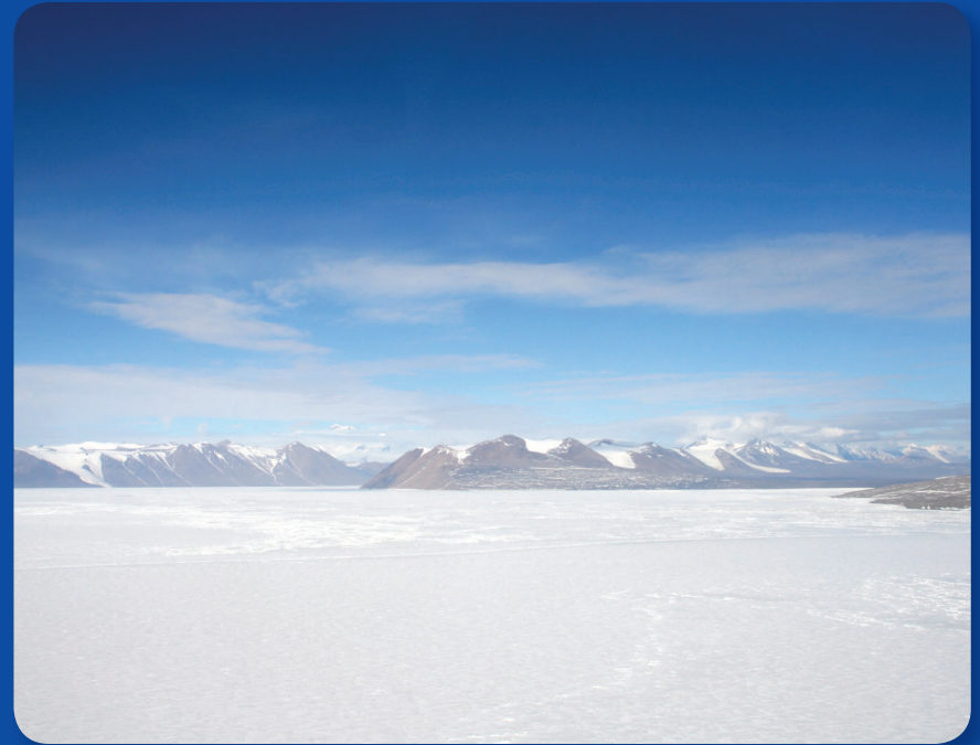
A frozen desert

The Antarctic is the coldest place on earth. In winter it can be as cold as -128^{\circ} F. It rarely snows in the Antarctic. However, in most of the Antarctic the snow that does fall never melts.