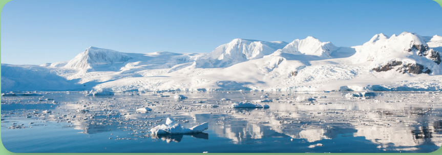
Paradise Bay in Antarctica