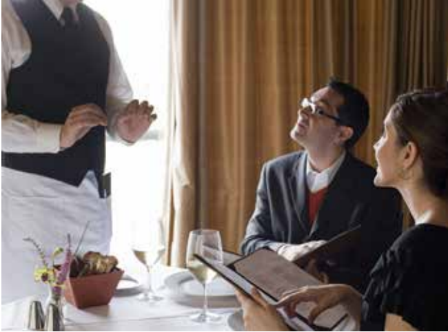
| Difference in Interpretation

“If you ask a British waiter for a napkin , he will be quite shocked. He will think you need a baby’s diaper! You should have asked him for a serviette. ”