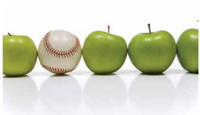
| Misplaced Item

Notice also that all members of a category are related to each other in the same way.