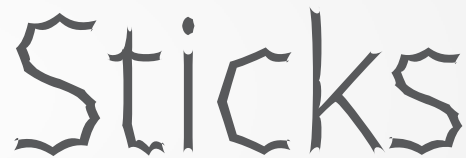
| Ball and Sticks