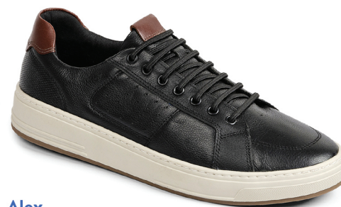
Alex RVR58400-NSC29 Medium Fit, Size 40-46 New Soft Back