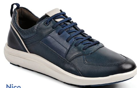
Nico STN54035-NSBB5 Medium Fit, Size 40-46 New Soft Blue