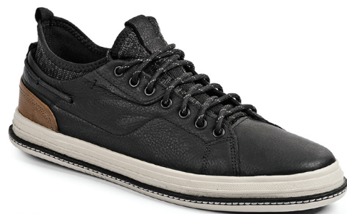
Gabs STK56000-GX24R Medium Fit, Size 40-46 Graxo Black