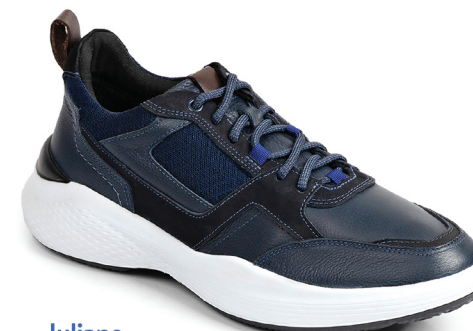
Juliano FON57005-NS2810 Medium Fit, Size 40-46 New Soft Petrol Also available in: ● Black