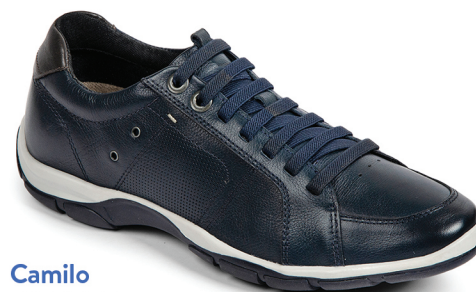
Camilo ZR42555 Medium Fit, Size 40-52 Denver Navy Also available in: ● Black