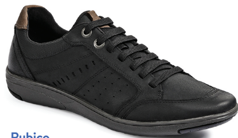
Rubico VRT53640-MC9WW Medium Fit, Size 40-46 Maraca Black