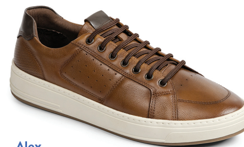
Alex RVR58400-NS36K Medium Fit, Size 40-46 New Soft Camel