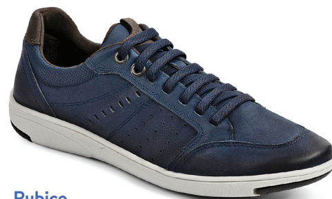
Rubico VRT53641-MC3OU Medium Fit, Size 40-46 Maraca Blue