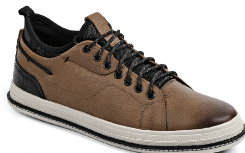
Gabs STK56000-GX24U Medium Fit, Size 40-46 Graxo Camel