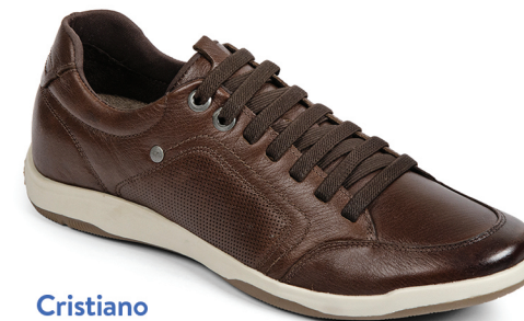
Cristiano SP40600 Medium Fit, Size 40-50 Denver Brown Also available in: ● Black