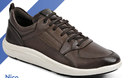
Nico STN54035-NSBB3 Medium Fit, Size 40-46 New Soft Whisky