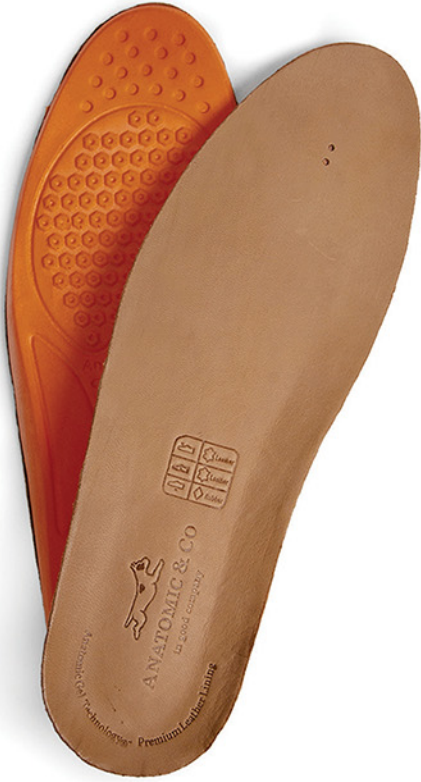
360 Air Insole