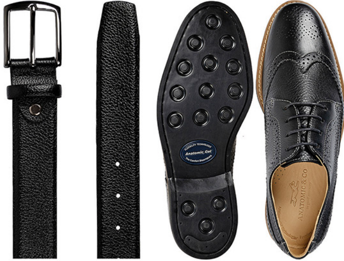
Rubens Belt Available in Black and Brown