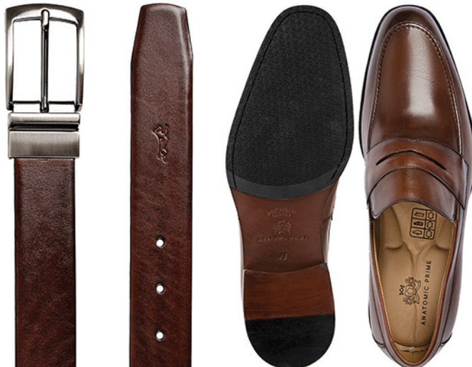
Rodrigo Belt Reversible Black and Pinhao