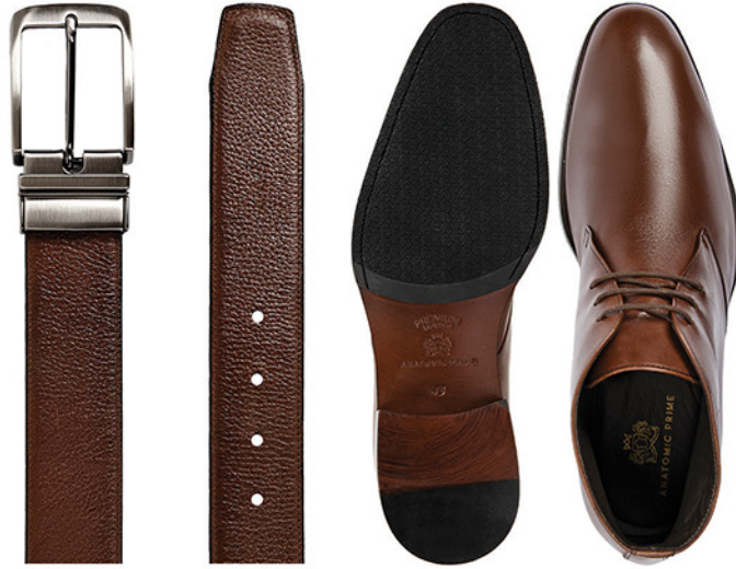
Pedro Belt Reversible Black and Tan