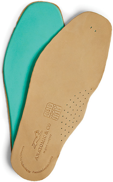
New York Insole