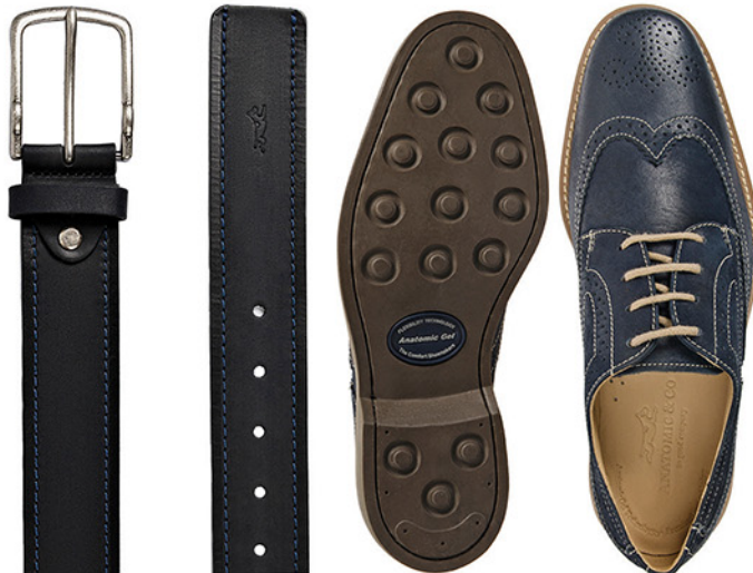
Gaspar Belt Available in Vintage Rust and Vintage Navy