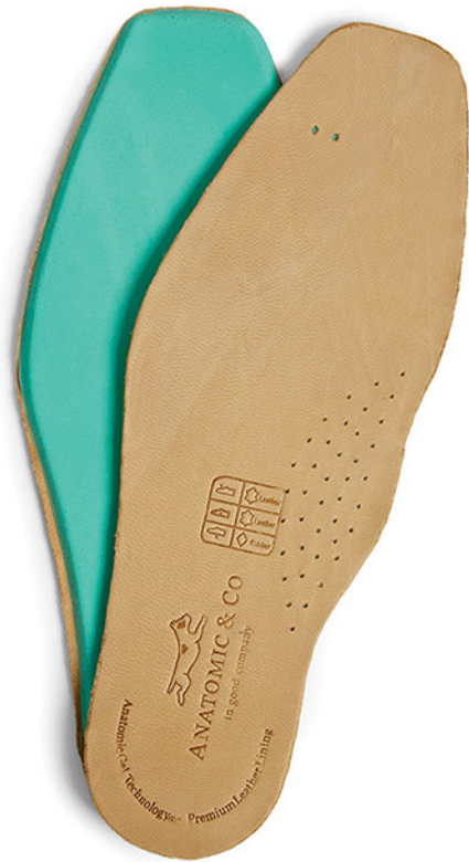
Milan, Italia and Impulse Insole