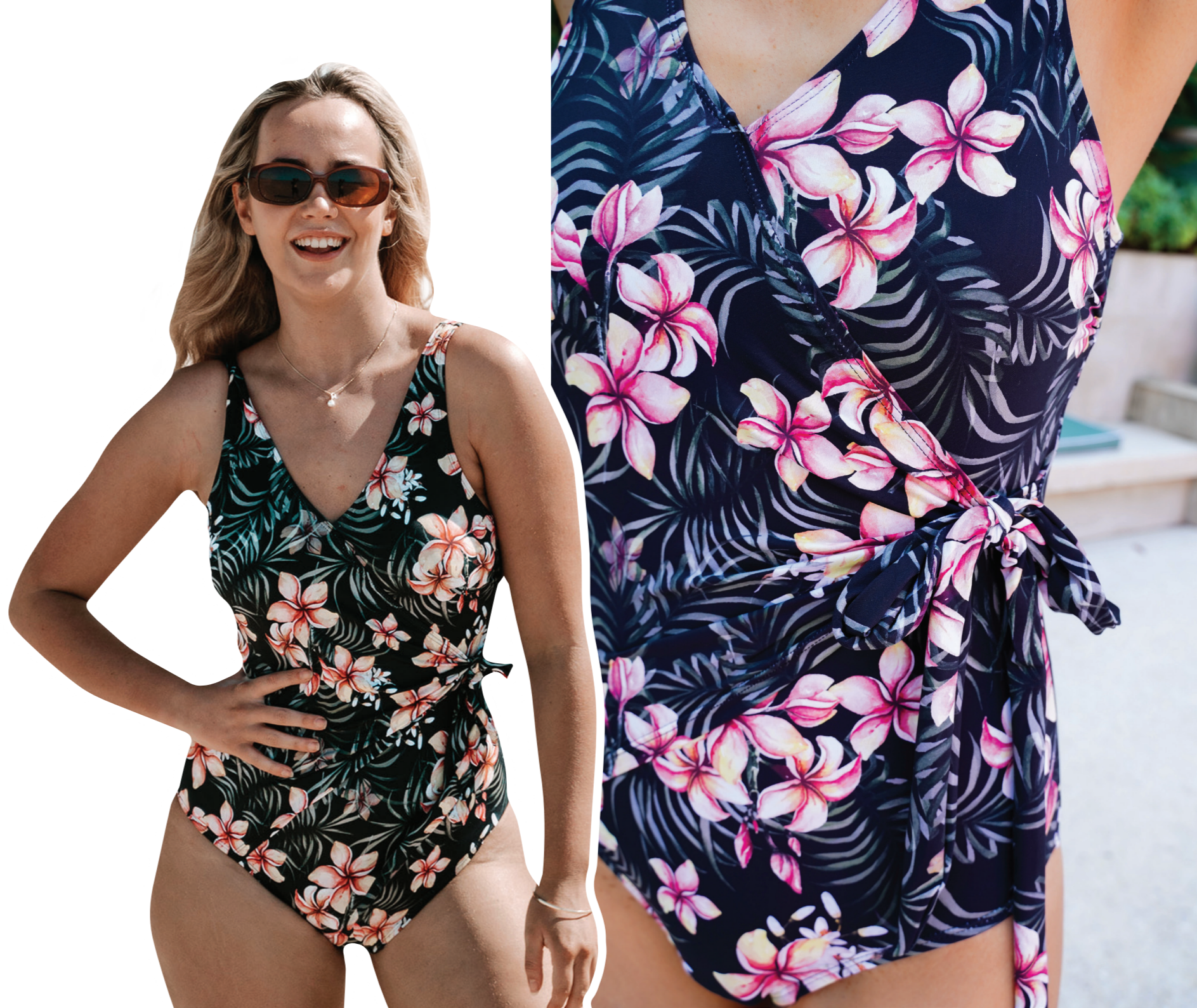
PARADISE WRAP ONE PIECE