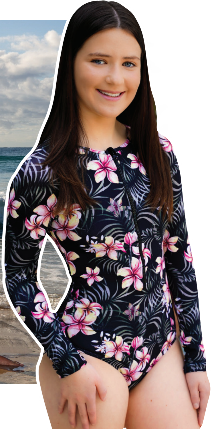
LAYLA LONG SLEEVE