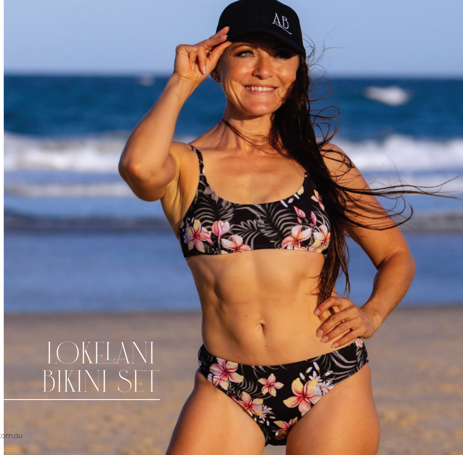
LOKFLANI BIKINI SET