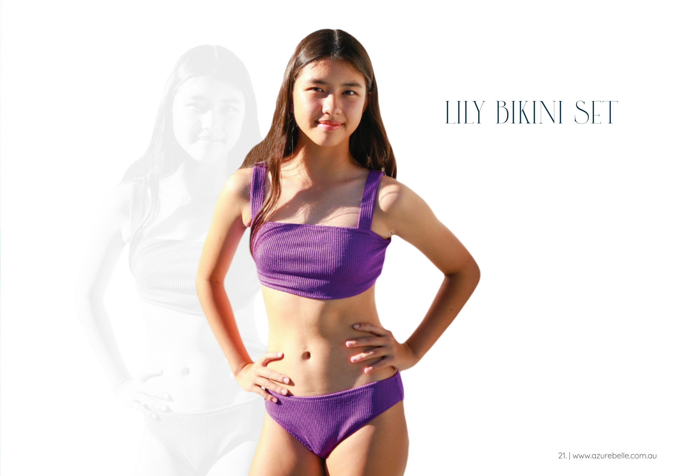
LILY BIKINI SET