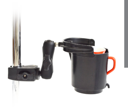
Add-On Mount Kit