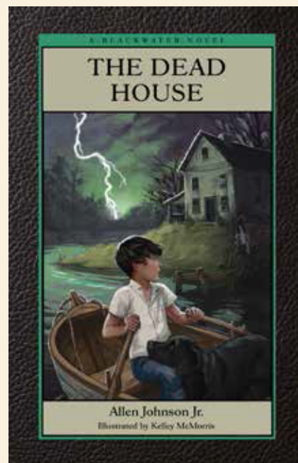
The Dead House , 224 pages ISBN 978-1-887654-82-1