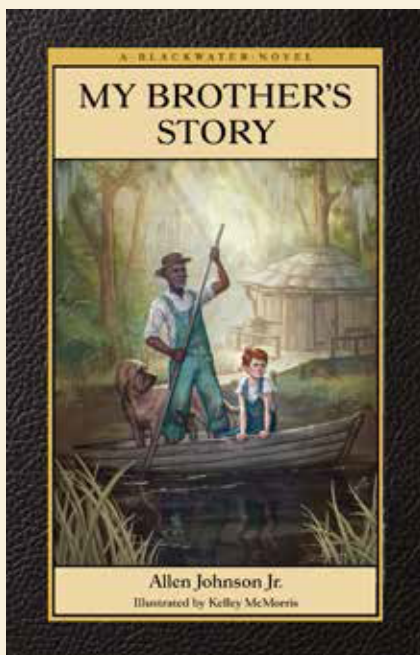
My Brother's Story , 204 pages ISBN 978-1-887654-81-4