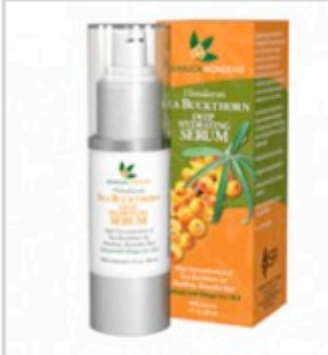
Seabuck Wonders 'Hydrating Serum'