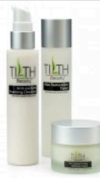
Tilth Beauty 'Anti-aging Regimen'