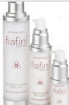
Fiadini 'Anti-aging Regimen'