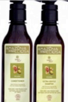
Surya Brasil 'Ucuuba Shampoo and Conditioner'