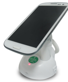
Alarm Display Post

In a retail store, if a theft attempt is made on your merchandise, staff can be alerted by an alarm sounding. This type of retail store security device is termed Electronic (Alarmed) Security. Typically, this style of system is used to protect higher valued merchandise, such as Mobile Phones, Tablets etc... These devices come in many different forms including alarm sensor cables, alarm display posts and cabinet alarms.