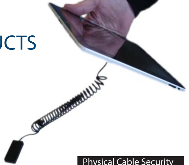
Physical Cable Security