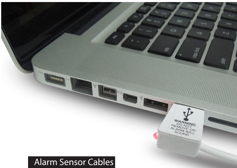
Alarm Sensor Cables