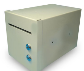
Cash Lock Box