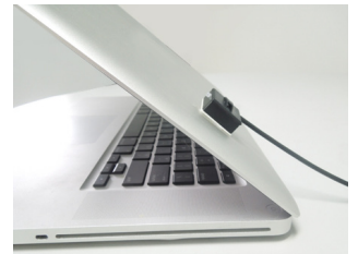
Alarm Sensor Cable