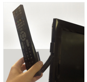
Coiled Cable Security