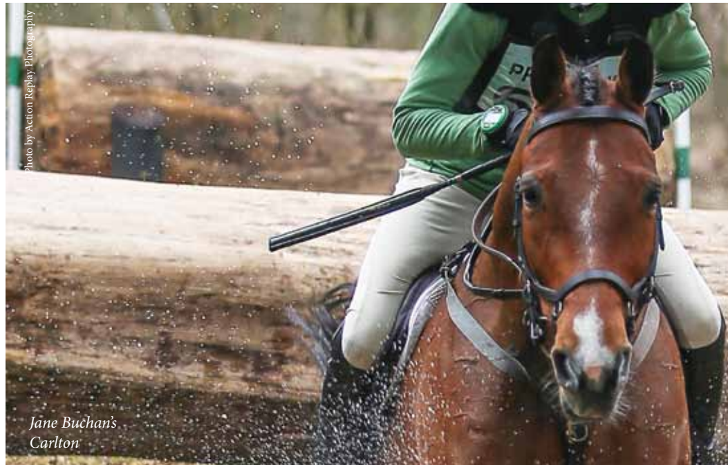
Jane Buchan's Carlton

Ease & Excel provides sufficient calories to maintain condition and fuel performance in the harder working horse, while still keeping starch levels to a minimum.