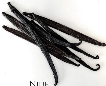
NIUE V. TAHITENSIS

6-7 beans per ounce. *Available only through the retail store *