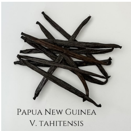
PAPUA NEW GUINEA V. TAHITENSIS

*Available in group orders and through the retail store *