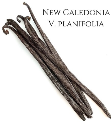
NEW CALEDONIA V. PLANIFOLIA