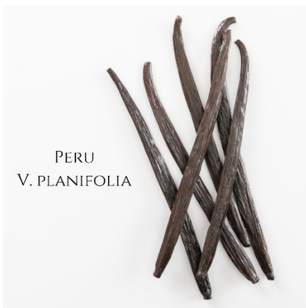
PERU V. PLANIFOLIA

*Available in group orders and through the retail store *