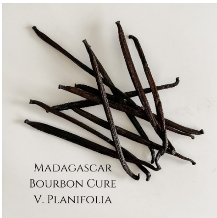
MADAGASCAR BOURBON CURE V. PLANIFOLIA

*Available only through the retail store *