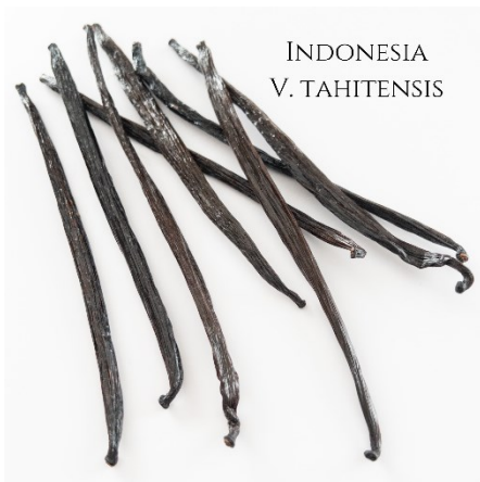
INDONESIA V. TAHITENSIS

*Available through group buys and on the retail store *