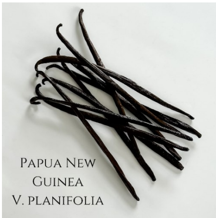
PAPUA NEW GUINEA V. PLANIFOLIA