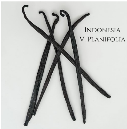
INDONESIA V. PLANIFOLIA