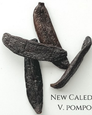
NEW CALEDONIA V. POMPONA

*Available only through the retail store *