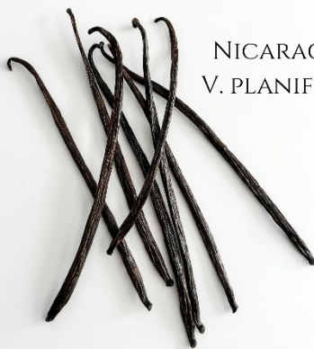
NICARAGUA V. PLANIFOLIA

*Available only through the retail store *