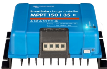
SmartSolar Charge Controller MPPT 150/35