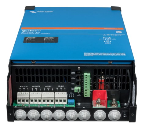
Connection Area Quattro-II 48/5k