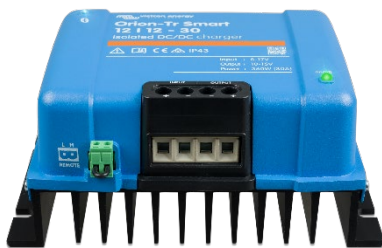
Orion-Tr Smart 12/12-30