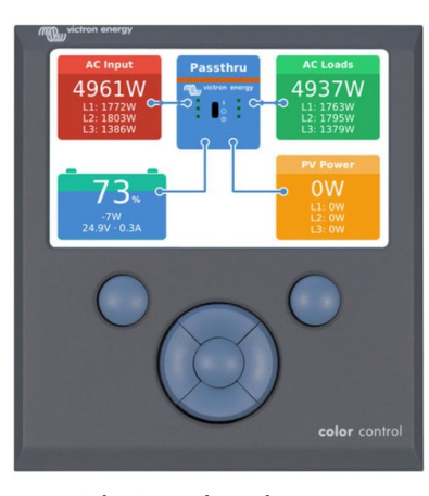
Color Control GX, showing a PV application

When connected to the Ethernet, systems with a Color Control GX or other GX device can be accessed and settings can be changed remotely.