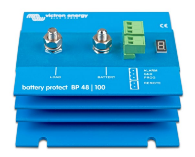
BatteryProtect BP 48-100