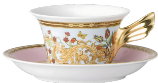
Rosenthal Versace Tea Cup with Saucer «Versace Garden», 220 ml, porcelain