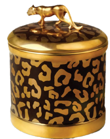
5. A great way to create a cozy atmosphere and emphasize the individual character of the interior.