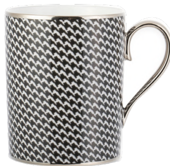
Legle Mug «Houndstooth» 250 ml, porcelain, black