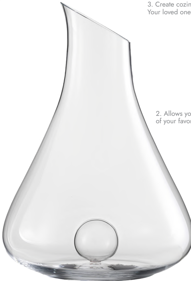
2. Allows you to fully enjoy the aroma and taste of your favorite wine.