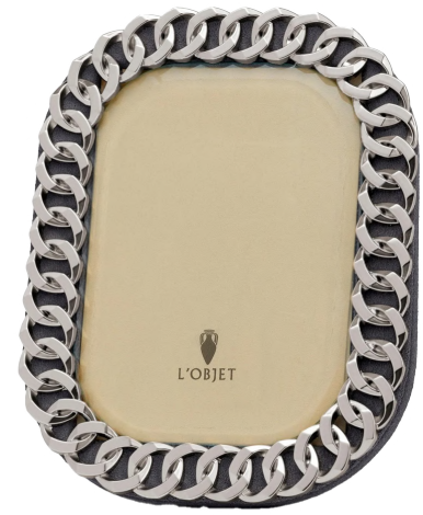
3. Create coziness and a special atmosphere at home. Your loved ones and friends will always be close to you