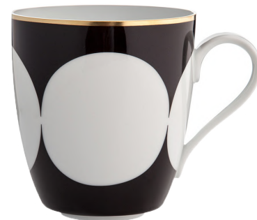
Sieger by Fürstenberg Coffee Cup, rounded « My Porcelain! Golden Palace», 250 ml