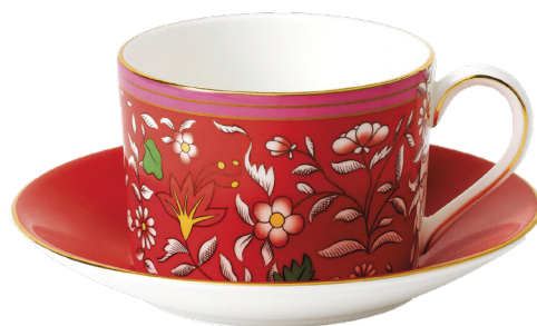
Wedgwood Set of Tea Cups with Saucers «Vanderlust», 150 ml, 4 pieces, porcelain