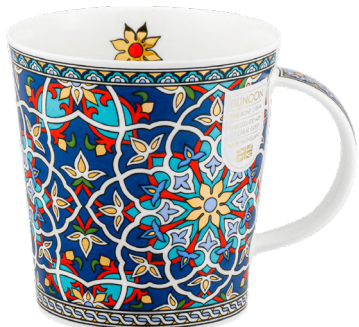
Dunoon Mug «Sheikh Lomond», 320 ml, bone china, red