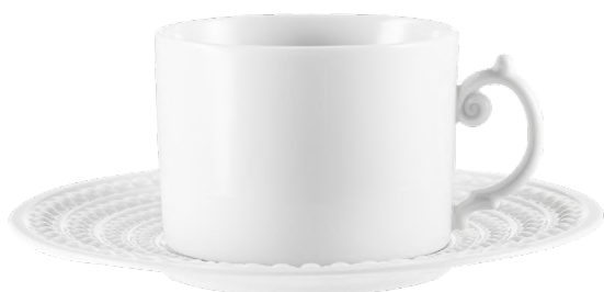
L'Objet Tea Cup with saucer «Pearls», 230 ml, white decor, porcelain