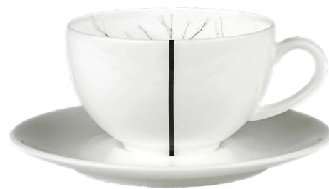
Dibbern Tea-Coffee Cup with Saucer «Black Forest. White Decor», 250 ml