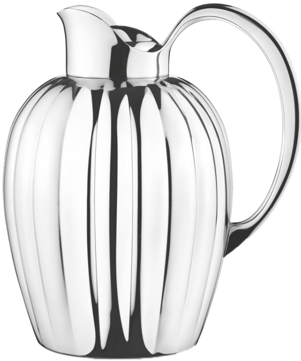
1. A simple and stylish solution for maintaining beverage temperature on your table.