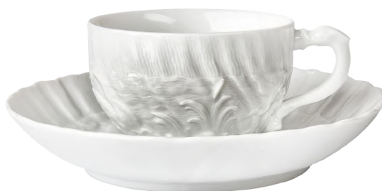
Meissen Meissen Tea-Coffee Cup with Saucer «Swan Service», 140 ml, white relief