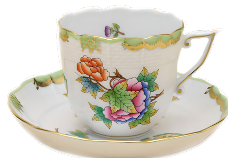
Herend Coffee Cup with Saucer «Victoria», 160 ml