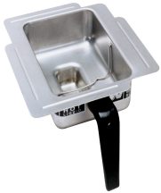
FUNNEL ASSY, SST-PP BLK HDL