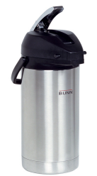
AIRPOT, 3.8L SST LA SINGLE PK