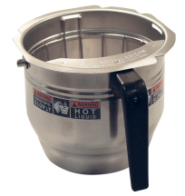
FUNNEL AY,W/DECAL GRT "C"7.12