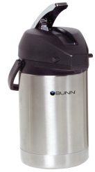
AIRPOT, 2.5L SST LA SINGLE PK