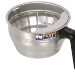
FUNNEL ASSY, SST-BLK HDL(7.12