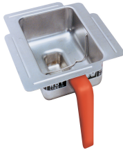
FUNNEL ASSY,SST-PP ORANGE HDL