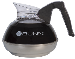
DECANTER, EASY POUR® BLACK-CANADA 1/CS