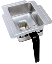
FUNNEL ASSY, SST-PP BLK HDNL