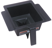
FUNNEL W/DECAL,PPK NAR BLK(SM)