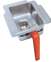
FUNNEL ASSY,SST-PP ORANGE HDL