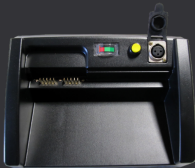
Home Docking Station