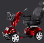
FR 510F II