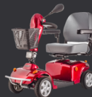
FR 168 4S-II