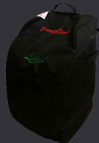
Soft Storage Bag